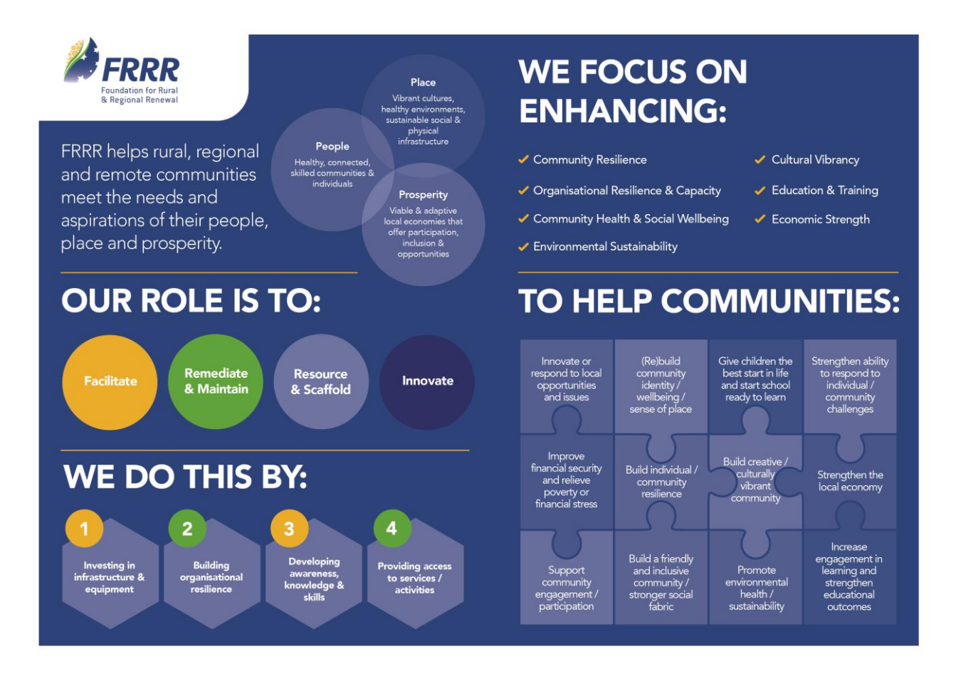
Figure 2: The FRRR Theory of Change